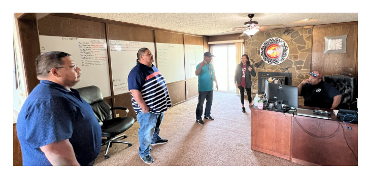
Chairman and AST EC at the Absentee Shawnee Headquarters; they met to discuss future agriculture plans.