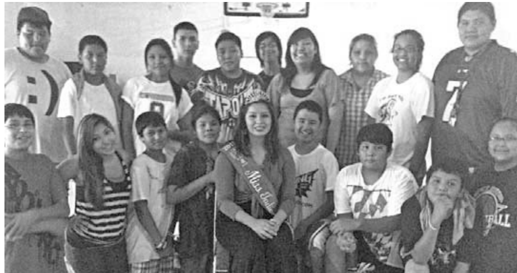
The Tribal Youth Program's summer camp for Native Youth held for the month of June, promoted healthy lifestyles. The program partnered with organizations in the community. Partners included The KTHC Behavioral Health Dept., KTO Environmental Dept., KTHC Diabetes Prevention & All Nations Fitness Center.