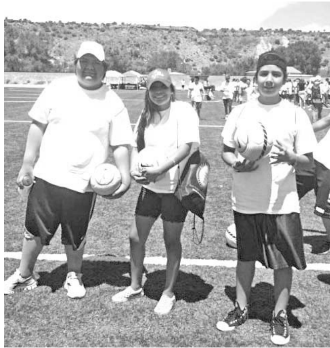
3 of the 4 Kickapoo UNITY youth Council members selected to attend the National Native Youth Summit in Santa Fe, NM. Youth day out with Notah Begay III (NB3) Foundation at the San Felipe Pueblo.