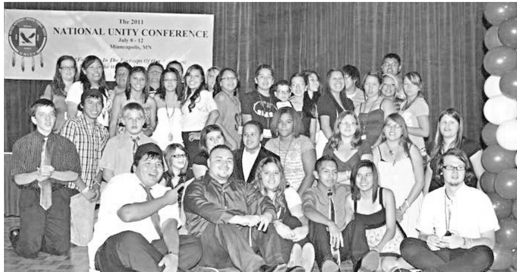
Kickapoo UNITY Youth Council attended the National UNITY Conference in Minneapolis, MN from July 7-12, 2011. (In the picture: Kickapoo, Sac & Fox, Citizen Potawatomi Nation Youth Councils, along with male co-president of the UNITY Executive Committee Victor Fuentes)