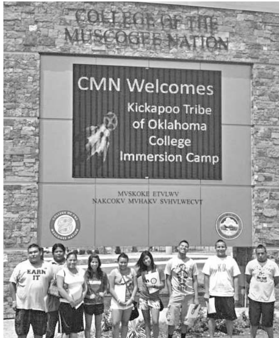
Native Youth in the community participated in a week long college preparation camp which was held August 1-5, 2011. Youth toured different college campuses throughout the week.